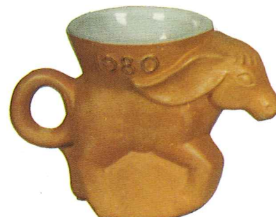
1980 DONKEY MUG

AVAILABLE IN 1980 COLOR: TERRA COTTA 5 OZ. COFFEE MUG