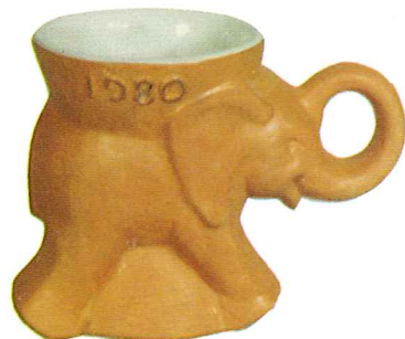
1980 ELEPHANT MUG

AVAILABLE IN 1980 COLOR: TERRA COTTA 5 OZ. COFFEE MUG